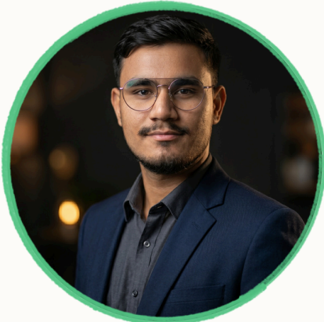
Safer · CEO & CTO